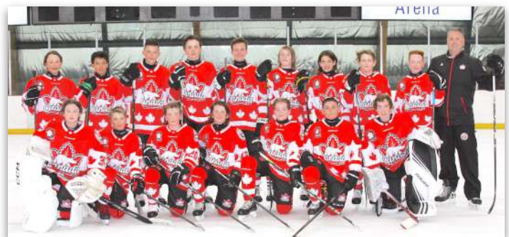
Canada Bears U13AA - 2022