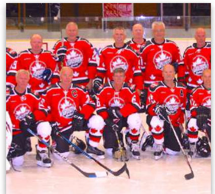
Canada Bears Oldtimers Hockey