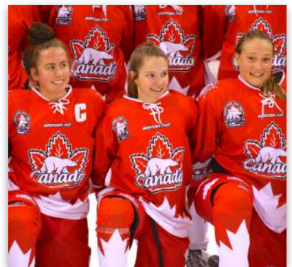
Canada Bears Female Hockey