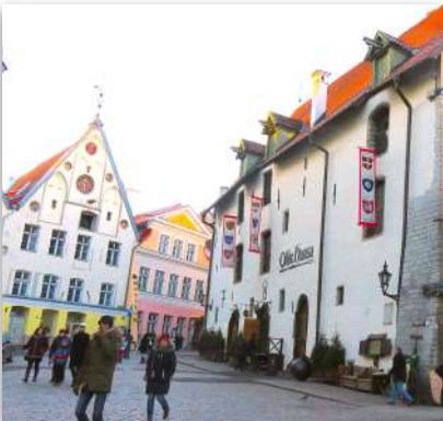
Old Town Tallinn