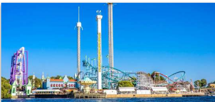
Grona Lund Amusement Park in Stockholm