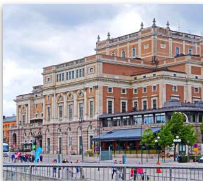
Royal Palace in Stockholm

Tips for the tour guide and driver are not included.