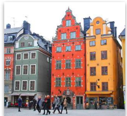
Stortorget in Stockholm