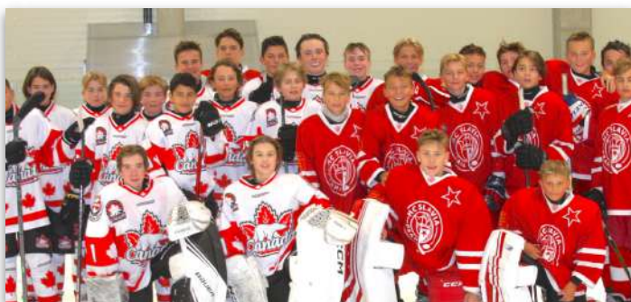
Canada Bears and Slavia Prague