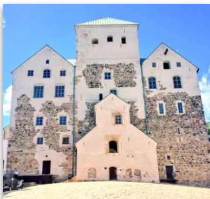
Turku Castle, Finland