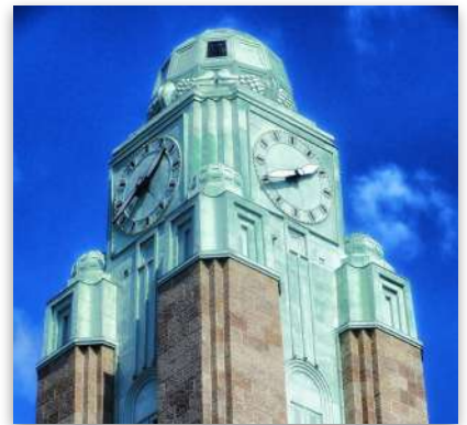
Helsinki Train Station Tower