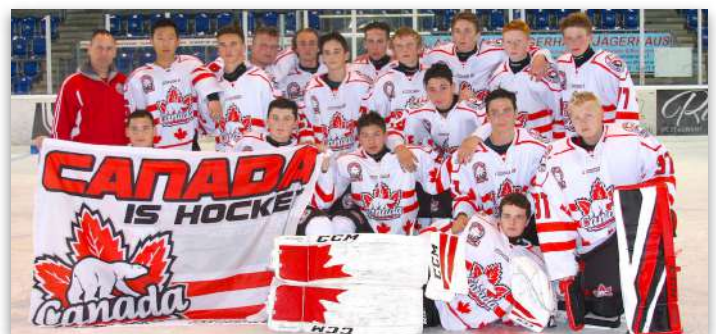
Canada Bears in Fussen, Germany