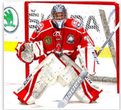
Canada Bears Goalie