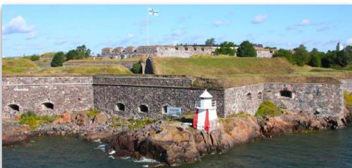
Suomenlinna Fortress, Helsinki