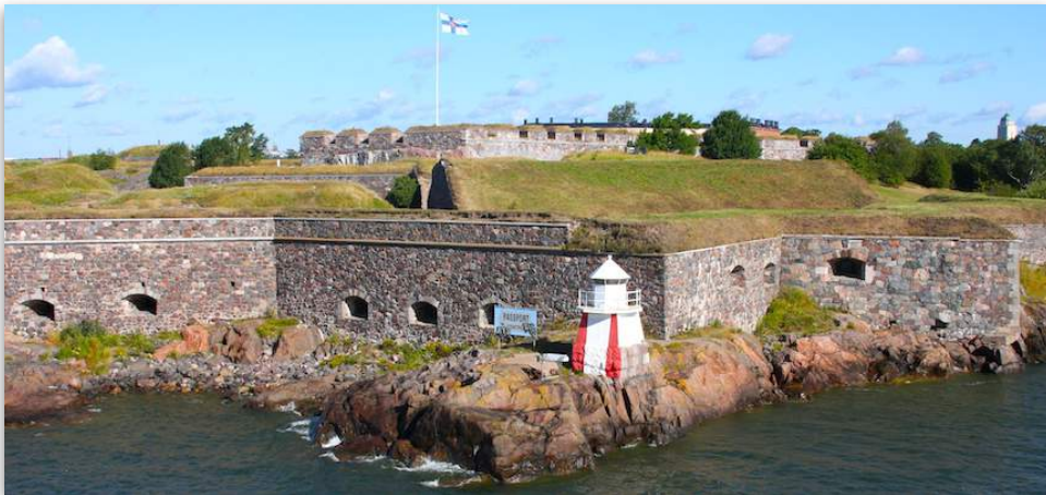
Suomenlinna Fortress, Helsinki