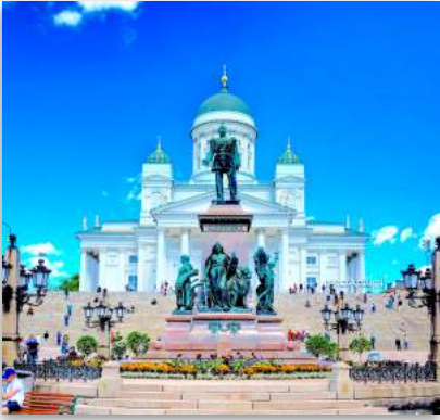
Senate Square in Helsinki