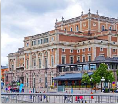
Royal Palace in Stockholm