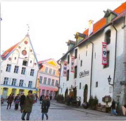
Old Town Tallinn