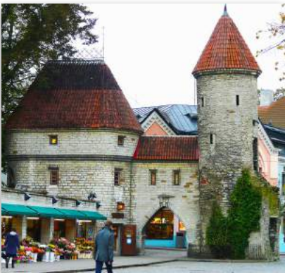
Viru Gate in Tallinn