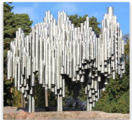
Sibelius Monument in Helsinki