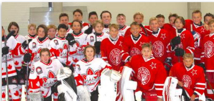
Canada Bears and Slavia Prague