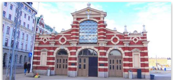
Helsinki Old Market