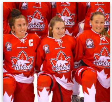
Canada Bears Female Hockey