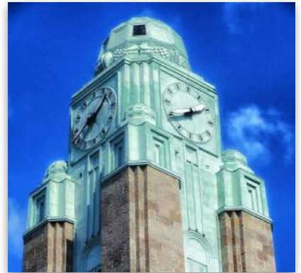
Helsinki Train Station Tower