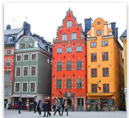
Stortorget in Stockholm