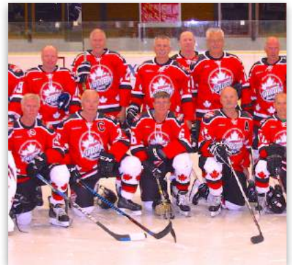
Canada Bears Oldtimers Hockey