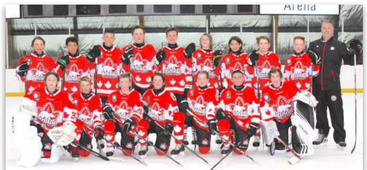
Canada Bears U13AA - 2022