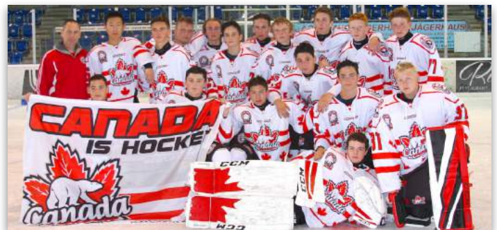
Canada Bears in Fussen, Germany