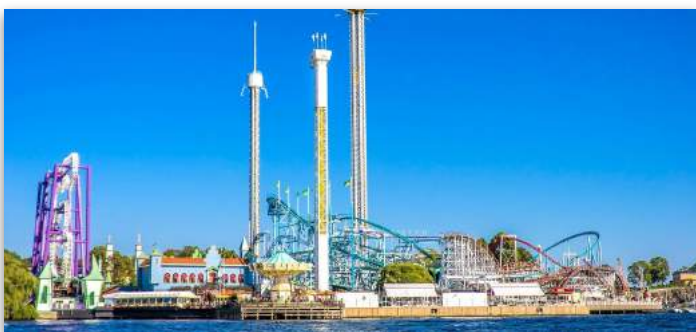
Grona Lund Amusement Park in Stockholm