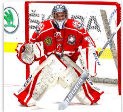
Canada Bears Goalie