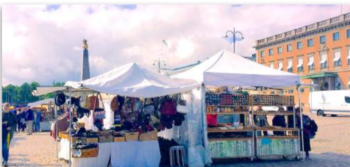
Market Square, Helsinki