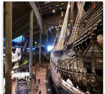
Vasa Museum in Stockholm