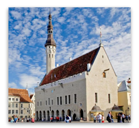
Tallinn City Hall