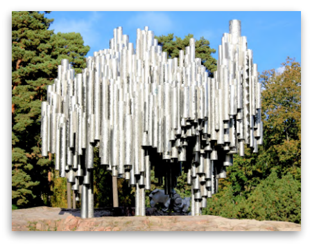
Sibelius Monument, Helsinki

HOCKEY TOURNAMENT – 3 games with 2 x 15 minute periods.