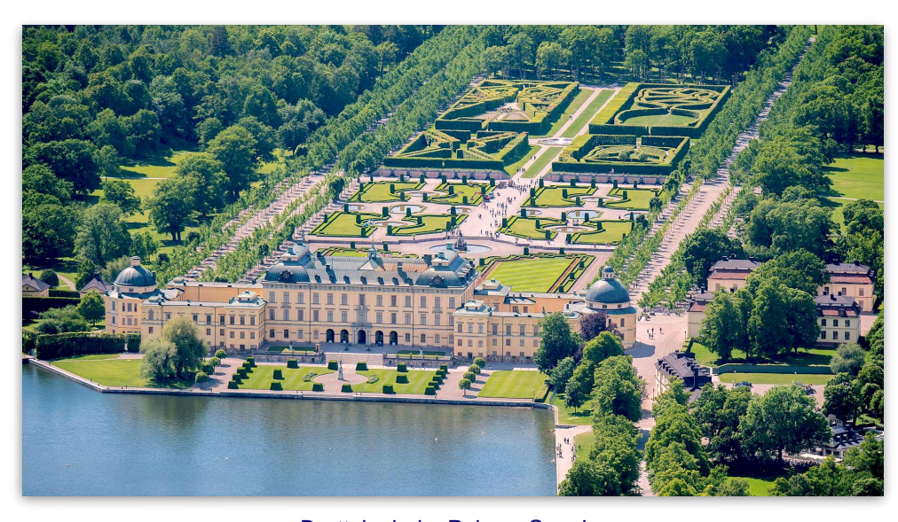
Drottningholm Palace, Sweden

Dinner included at the hotel. Evening free.