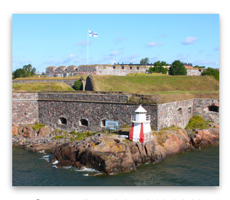
Suomenlinna Island, Helsinki