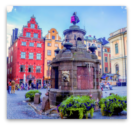
Gamla Stan, Stockholm