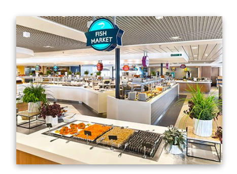
Baltic Queen Ferry Buffet