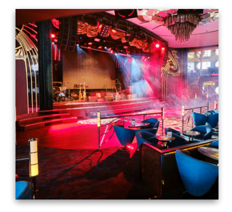
Baltic Queen Show Room

All teams are independent so Azorcan plays no part in player selection, team staff selection, staff decisions or pre-departure programs.