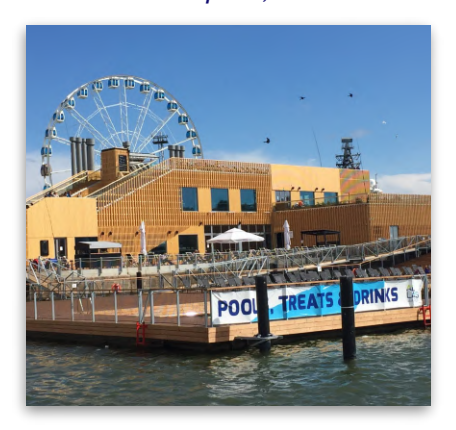
Allas Sea Pools, Helsinki