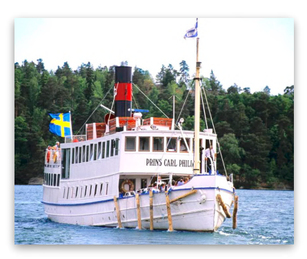
Archipelago Lunch Cruise