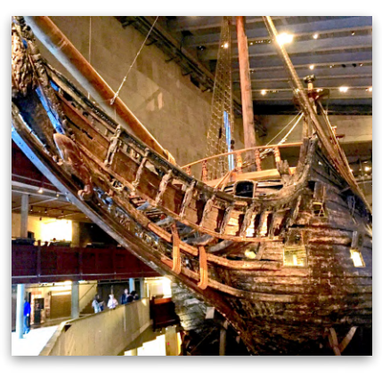
Vasa Ship Museum