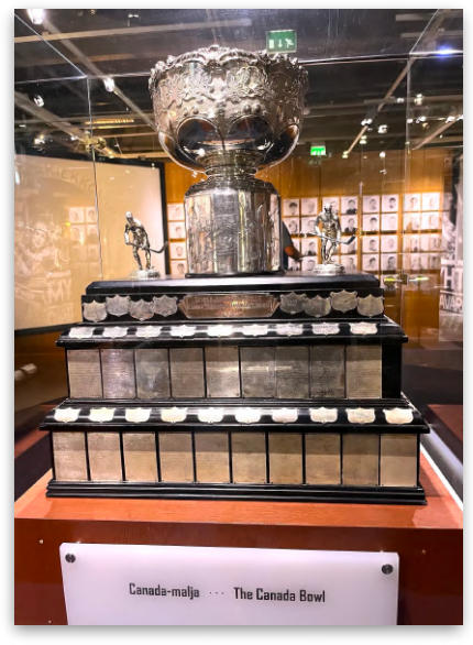
Finnish Hockey Hall of Fame